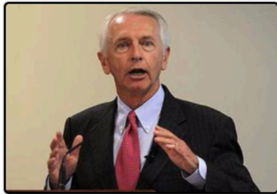
Governor Steve Beshear

These were the three speakers from the 2012 East Kentucky Leadership Conference in Prestonburg, Kentucky.